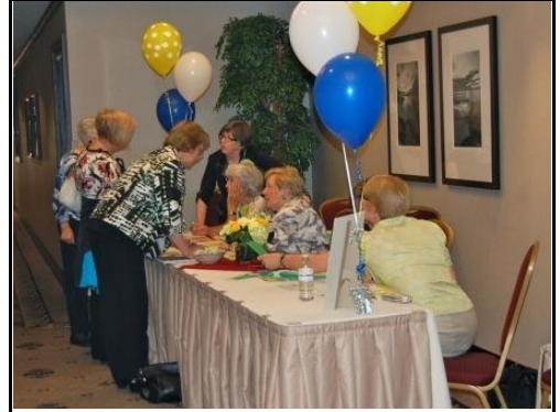
Registration at the Hampton Inn

members attended and/or assisted with the conference.