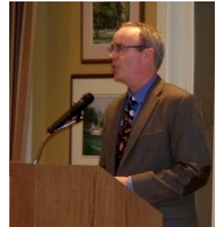
Guest Speaker: Novelist Terry Fallis

On May 9, we held our annual banquet at Lambton Golf and Country Club. It was a great evening - good conversation, good food and a great speaker - the author Terry Fallis. During his talk, Terry told us that his first book The Best Laid Plans is being made into a TV mini series that will be shot this summer: he expects it will be shown on CBC starting January 2014 so watch for that. Thanks to everyone who worked to make the banquet such a success - planning, selling tickets and flowers.